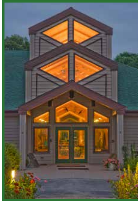
Prairiewoods is sponsored by Franciscan Sisters of Perpetual Adoration.

Prairiewoods Franciscan Spirituality Center is an ecospirituality retreat and conference center in the Franciscan tradition. It is located on 72 acres of woods and prairie on the outskirts of Cedar Rapids, Iowa. Prairiewoods offers a variety of programs and retreats, as well as conference space to rent. Please join us for an enriching experience in this relaxing, nurturing environment!