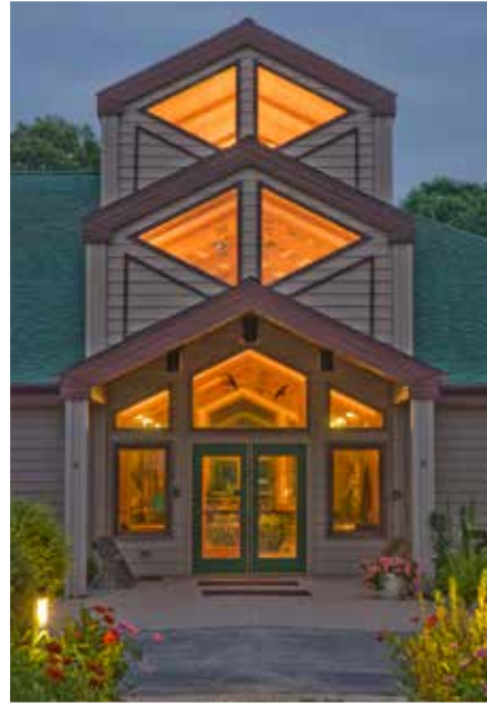
Prairiewoods is sponsored by Franciscan Sisters of Perpetual Adoration.

Prairiewoods Franciscan Spirituality Center is an ecospirituality retreat and conference center in the Franciscan tradition. It is located on 72 acres of woods and prairie on the outskirts of Cedar Rapids, Iowa. Prairiewoods offers a variety of programs and retreats, as well as conference space to rent. Please join us for an enriching experience in this relaxing, nurturing environment!